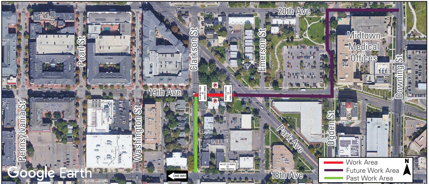
This map is a graphic and may not show exact locations.