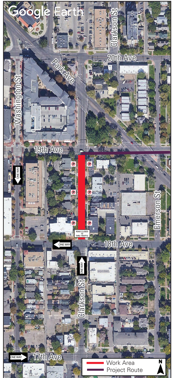
This map is a graphic and may not show exact locations.